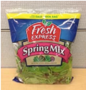
5 oz. bag of washed salad greens

What percentage of the product are you (or your household) likely to consume, based on your recent consumption habits?