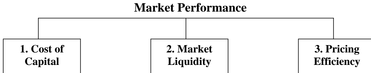
Figure 2: Market Performance Measures and Their Empirical Proxies