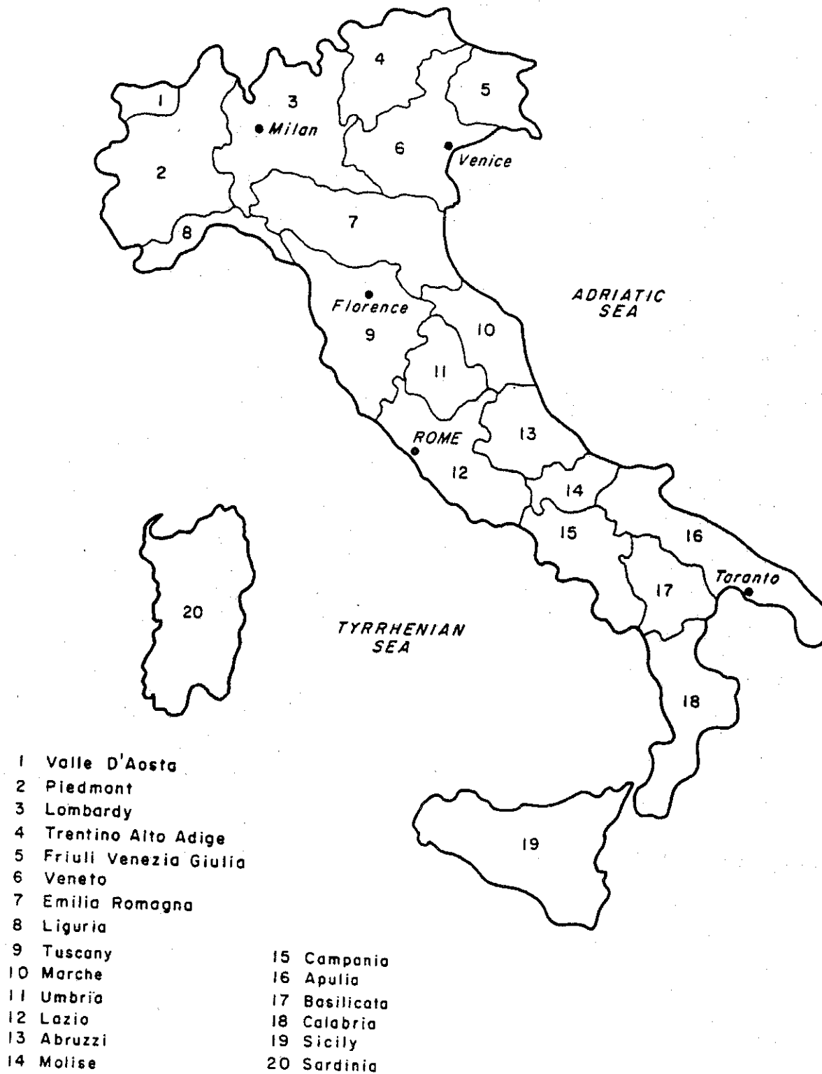
Figure 1 The Regions of Italy